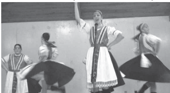
The members of the popular Pittsburgh Area Slovak Folk Ensemble entertained during the afternoon program provided a colorful and entertaining display of Slovak music and dance at its best.