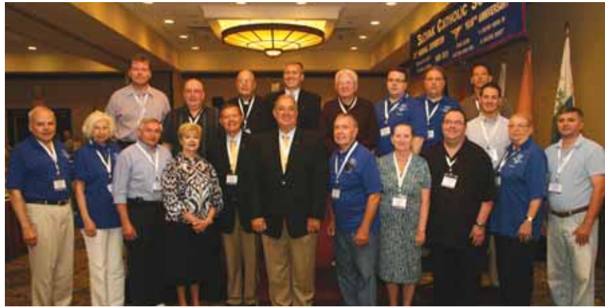
Delegates from Group 1, Passaic, N.J.