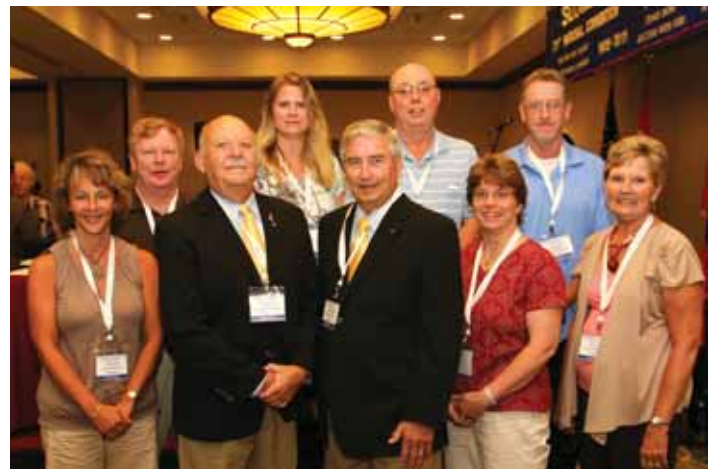
Delegates from Group 3, East Douglas, Mass.