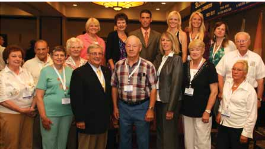
Delegates from Group 4, Chicago, Ill.