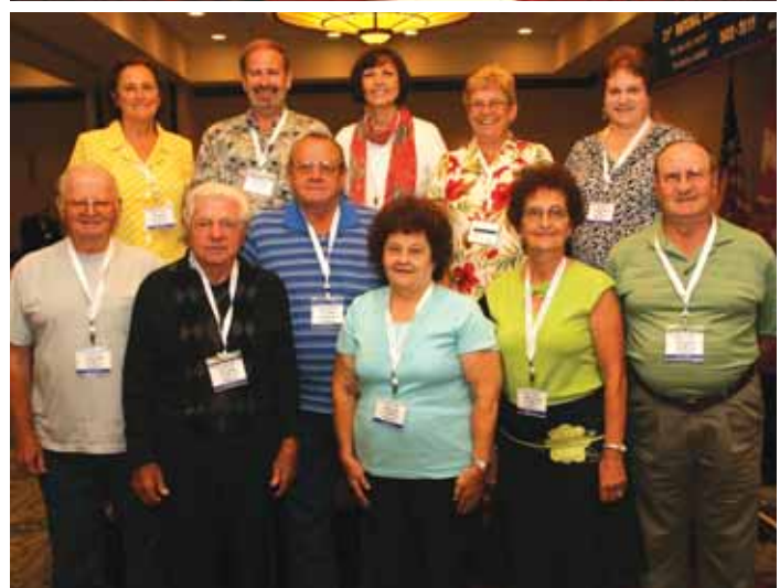
Delegates from Group 9, Johnstown, Pa.