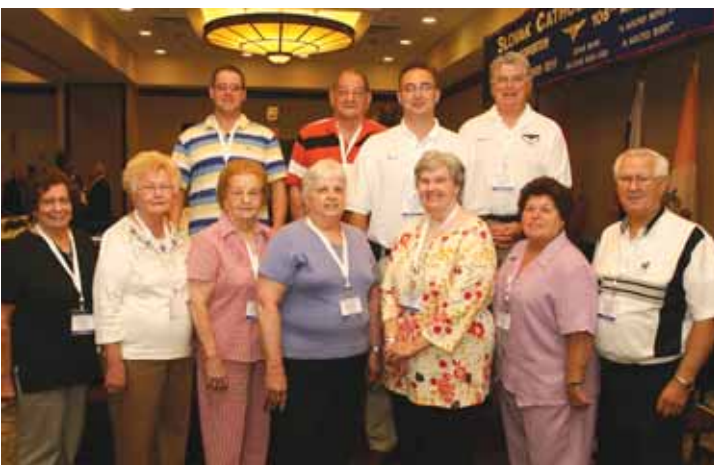
Delegates from Group 6, Perryopolis, Pa.