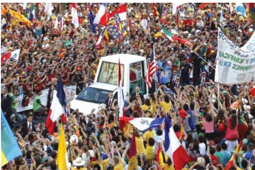
Tisíce účastníkov festivalu víтали 18. augusta v uliciach Madridu pápeža Benedikta XVI.

Od 16. do 18. augusta sa v Madride konali Svetové dni mládeže 2011. Na medzinárodnom mládežníckom podujatí sa zúčastnili takmer dva milióny ľudí z celého sveta.