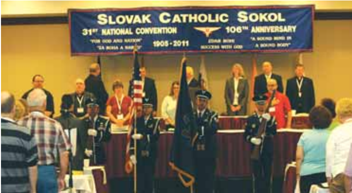
The opening session of our 31st National Convention was officially called to order on Sunday, July 31 at 9 a.m. Part of the colorful opening rites included the Presentation of Colors by members of the U.S. Air Force 9/11 Airlift Wing of Pittsburgh. Members of the unit are shown above in the convention hall at The Radisson Hotel Pittsburgh Green Tree.