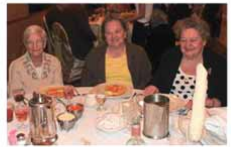
Group 4 Anniversasy Members and Guests