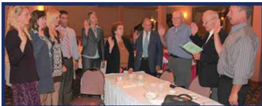
Presenting the newly elected Group 4 Officers