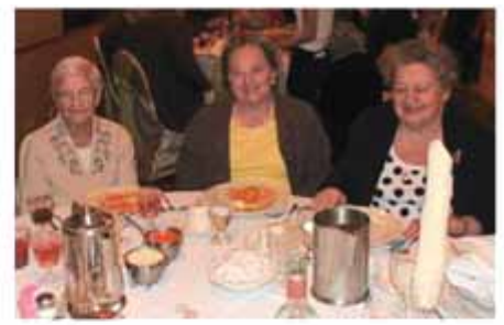
Group 4 Anniversasy Members and Guests