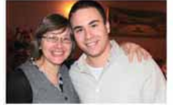
Group 4 Members and Guests enjoying a delicious dinner and program