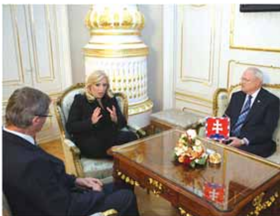
Na snímke zľava sú: predseda Národnej rady SR Pavol Hrušovský, premiérka Iveta Radičová a prezident Ivan Gašparovič.

Prezident Slovenskej republiky Ivan Gašparovič 25. októbra odvolal predsedníčku vlády SR Ivetu Radičovú a poveril ju vykonávaním svojej pôsobnosti až do vymenovania novej vlády. Prezidentovi to umožnila novela Ústavy Slovenskej republiky. Zmena, ktorú parlament odobril 21. októbra, prezidentovi umožňuje poveriť vládu ďalším vykonávaním funkcií, aj keď stratila dôveru zákonodarného zboru. Na ústavnom akte v Prezidentskom paláci bol prítomný aj predseda Národnej rady SR Pavol Hrušovský.