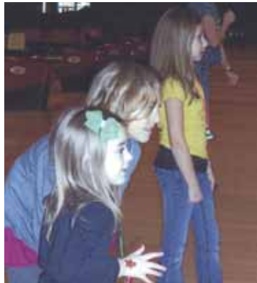
Our young Sokol bowlers enjoy the camaraderie.