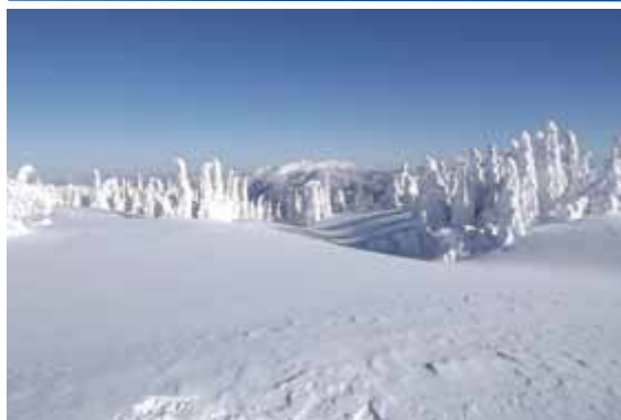
Zima na Slovenských horách.

Medzinárodný súdny dvor zriadili v roku 1945 a je jediným zo šiestich hlavných orgánov OSN, ktoré nesídli v New Yorku. - TASR