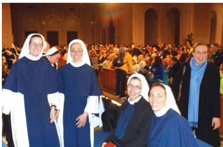
A group of Sisters of Life from New York City during the National Prayer Vigil at the Basilica of the National Shrine of the Immaculate Conception.