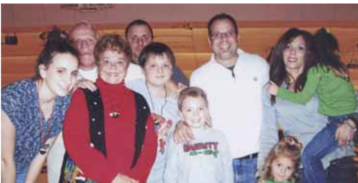
Three generations of the Blasko family are shown enjoying the activities.