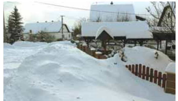
Sneh, ktorý husto padal päť, vytvoril na Kysuciach rozprávkovú krajinu.

Počasie opäť potrápilo Slovákov. Po arktických mrazoch, ktoré ich trápili vyše dvoch týždňov, sa museli v polovici februára do slovne vyhrabávať zo snehu.