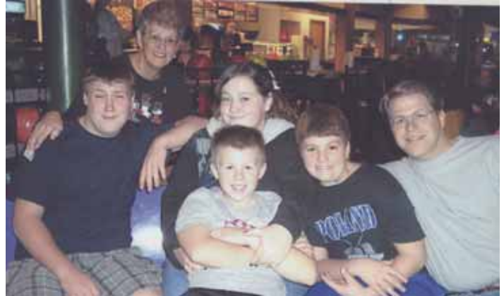
Three generations of the Gonda family enjoy the afternoon's festivities.