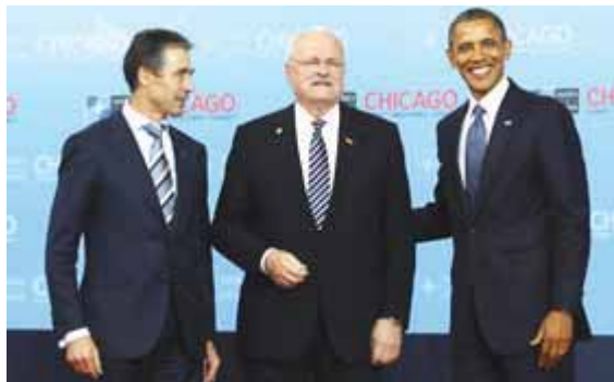
Prezident USA Barack Obama mal počas summitu krátky rozhovor aj s prezidentom Gašparovičom. Na snímke sú (zľava): generálny tajomník NATO Anders Rasmussen, prezident Gašparovič a prezident Obama.