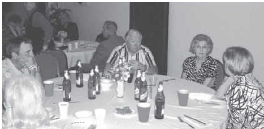
Some of the guests at this year's 60th Annual Florida Slovak Day, who hailed from various parts of the Sunshine State, are shown above enjoying the luncheon on Sunday, March 4th at The Slovak Garden in Winter Park, Fla.