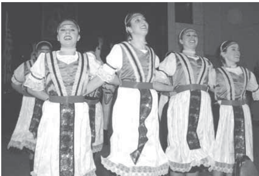
The highlight of this year's 60th Annual Florida Slovak Day, held on March 4th at The Slovak Garden in Winter Park, Fla. was the spirited and entertaining performance of the PAS Slovak Folk Ensemble of Pittsburgh, Pa. The group performed an array of colorful and entertaining dances representing the various regions of Slovakia.