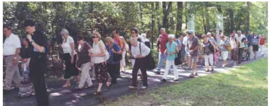
Pilgrims begin the afternoon devotions along the Rosary Walk of the shrine.