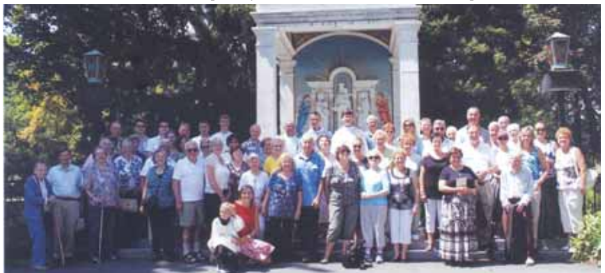
The pilgrims from across the New York- New Jersey metropolitan area pose for group photo at the outdoor altar of the Marian Shrine.

The pilgrimage concluded at 2:30 p.m. with traditional Rosary devotions processing on the scenic grounds of the shrine which is conducted by the Salesians of St. John Bosco. Thanks and gratitude goes out to all who made this year's pilgrimage a success as a fitting tribute to the Mother of God on the feast of her Assumption.