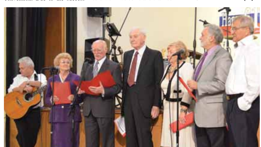
Members of the Patran Singing Group entertained with Slovak songs.