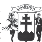
SLOVAK FOLK ENSEMBLE

Since its founding in New York City in 1966, Limborra has enjoyed a rich history of providing its audiences with an authentic presentation of Slo-