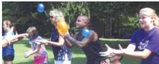
Balloon toss - get ready for a splash!

A good turnout of Sokol members from across the Mahoning Valleys turned out for the annual Family Day Picnic hosted by Group 17, "Rev. Francis Skutil." The festivities were held at the Walter Scholl Pavilion of Mill Creek Park in Youngstown, Ohio. Group 17 families enjoyed a day of relaxation, various games and contests, camaraderie and of course, great food!