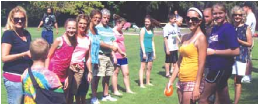
Young Sokols and Sokolky line up to begin the balloon toss action.

Walter Scholl Pavilion of Mill Creek Park + Youngstown, Ohio + Sunday, August 25