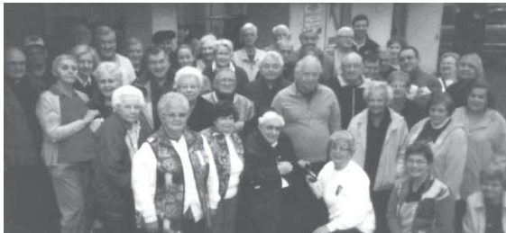
A group photo of some of the picnic-goers who enjoyed the annual event hosted by the Slovak Heritage Society of Northeastern Pennsylvania.