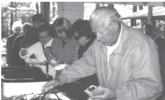
Enjoying the many culinary specialities at the annual picnic.