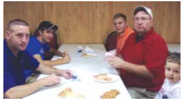
Following the action on the greens, the golfers enjoyed great refreshments at the North End Slovak Citizens Club.