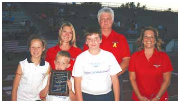
Group 17, Youngstown, Oh. was the winner of the John J. Stofko Spirit Award at the 46th Slet.