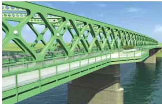
Vizualizácia plánovanej podoby Starého mosta v Bratislave.

Projekt bude stáť 58,8 milióna eur. Mesto na projekt požiadalo o nenávratný finančný príspevok. Na financovanie projektu sa bude z 85 percent podieľať Európska únia, desať percent príspeje štát a päť percent zaplatí mesto. Jednou z podmienok na čerpanie nenávratného príspevku je, že Starý most i električková trať Šafárikova námestie - Bosákova musia byť hotové do konca roka 2015.