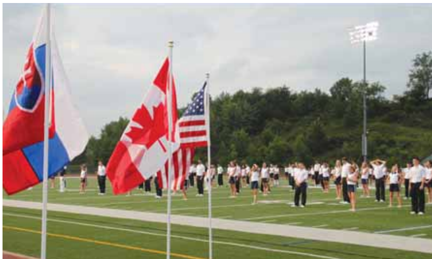
Záverečný ceremoniál, ktorý sa konal 18. júla pri príležitosti ukončenia 47. Zletu Slovenského katolíckeho sokola. Zlet sa konal od 14. do 18. júla v Slippery Rock University v Pensylvánii. Zúčastnili sa ho atléti z deviatich žúp. Zástavu víťazov si odniesli športovci zo 14. župy.