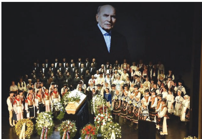
Posledná rozlúčka s profesorom Štefanom Nosálom.