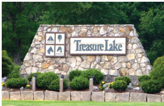
Treasure Lake Resort in DuBois, Pa.

offered. Those registered for this competition will play holes starting, Saturday August 19, 2017 and 9 on Sunday, August 20, 2017. (Based on number of requests)