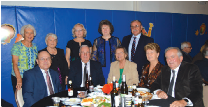
All smiles from some of the guests who enjoyed this year's Octoberfest.