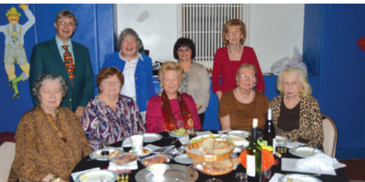
Some well-known Sokols and Sokolky who enjoyed the annual Octoberfest are shown above.