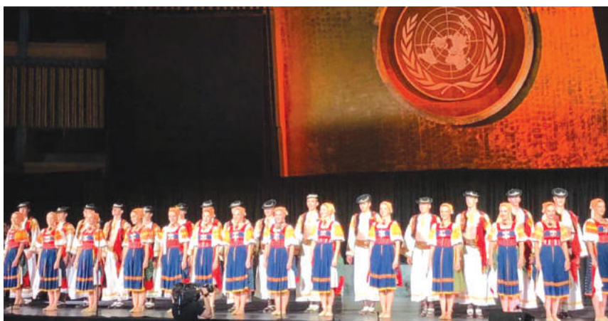
Súbor Lúčnica sa ako kultúrny ambasádor Slovenska predstavil v OSN pod novým logom "Lúčnica & Slovakia, Good Idea".

Medzinárodné spoločenstvo už 72 rokov oslavuje 24. október ako Deň Organizácie Spojených národov - sviatok vstupu Charty OSN do platnosti. Táto univerzálna medzinárodná organizácia vznikla v roku 1945 s cieľom po druhej svetovej vojne pomôcť vo svete udržať mier. Každoročne preto patrí 24. október medzi najdôležitejšie dni v kalendári OSN.