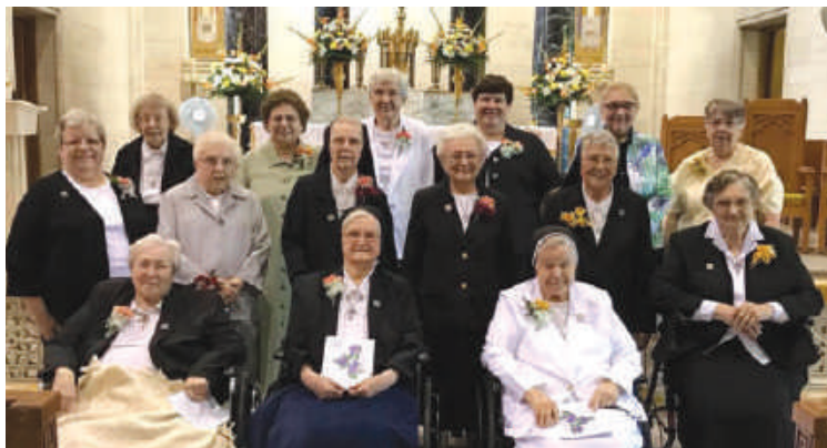
This year's jubilarians pose for a group photo in the Basilica of SS. Cyril and Methodius.

Our congratulations and fraternal best wishes go out to the Sisters of SS. Cyril and Methodius in general and this year's jubilarians in particular and pray that they may continue to reach out, to evangelize and teach, to care for the elderly, the young, the poor, the sick, the lonely, wounded families and immigrants in the best traditions of our Cyrilo-Methodian heritage of faith. Zdar Boh!