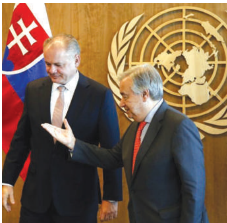
Prezident Andrej Kiska a generálny sekretár OSN Antonio Guterres.

Prezident okrem Masarykovho pamätníka navštívil aj Chicagskú univerzitu, kde študentom priblížil svoju cestu na prezidentský post, aj to, že kedysi v USA pracoval. Navštívil aj Benediktínsku univerzitu, kde sa stretol so Slováckmi žijúcimi v USA, a Slovak Academy of Chicago, kde sa desiatky detí každú sobotu učia slovenčinu.