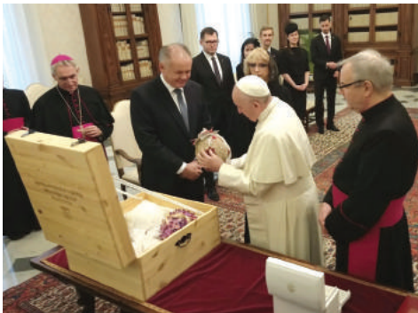
President Kiska, is handing over ornaments to Pope Francis.

Slovak President Andrej Kiska has had an audience on Friday, December 14 with Pope Francis, presenting him with a gift from Slovakia – four Christmas tree ornaments made by people from disadvantaged social groups in Slovakia.