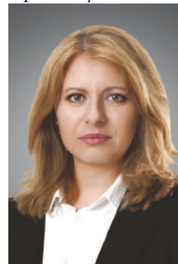
Novozvolená prezidentka Slovenskej republiky Zuzana Čaputová

Slováci si piatykrát v histórii Slovenskej republiky volili prezidenta v priamych voľbách. Slovensko malo dosiaľ štyroch prezidentov. Prvým bol Michal Kováč, ktorého však volil parlament. Priamo si občania volili hlavu štátu prvýkrát v roku 1999, vybrali si Rudolfa Schustera. Po ňom bol dvakrát na čele štátu Ivan Gašparovič a dosiaľ posledným prezidentom je Andrej Kiska. Funkčné obdobie mu uplynie 15. júna, keď bude inaugurovaná jeho nástupkyňa Zuzana Čaputová. Stane sa tak prvou ženou v úrade prezidenta Slovenskej republiky a zároveň vo veku 45 rokov aj najmladšou osobou, ktorá túto funkciu na Slovensku zastávala.