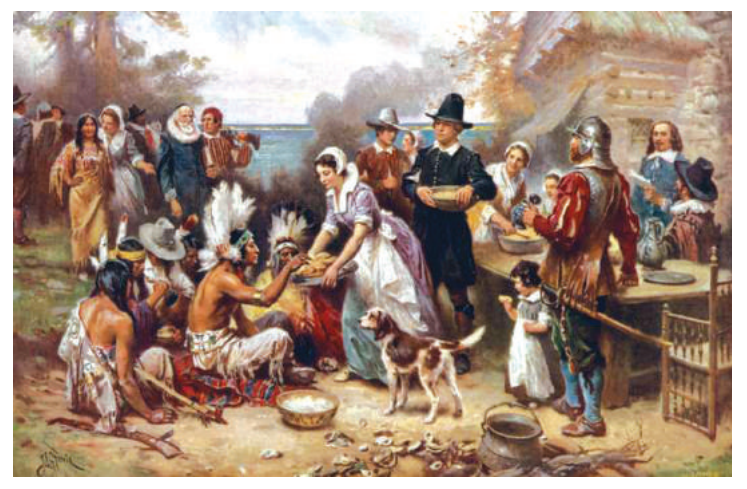
The first Thanksgiving 1621 by Jean Leon Gerome Ferris