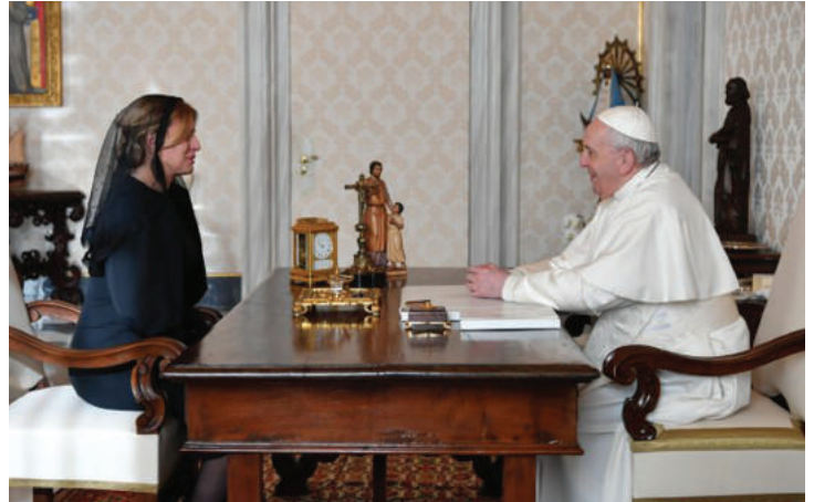
Pope Francis receives Slovak President Zuzana Caputova in the Vatican on December 14, 2020.

Slovak President Zuzana Caputova was received on Monday by Pope Francis, who told her to convey a message to the people in Slovakia that they should fight and hold out in the face of the coronavirus.