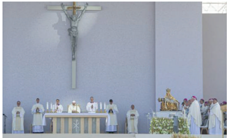
Pope Francis' Mass in Sastin on September 15, 2021.

Sastin, September 15 (TASR) – Pope Francis said a public farewell to Slovakia after completing the main Mass of his four-day visit in Sastin before noon on Wednesday, September 15 thanking the bishops present, President Zuzana Caputova, the civil authorities and everyone who contributed towards preparing his trip.