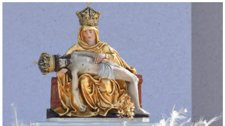
The miraculous sculpture of Our Lady of Sorrows in Sastin.

Background to Pope Francis' Mass: Our Lady of Sorrows, Patron Saint of Slovakia