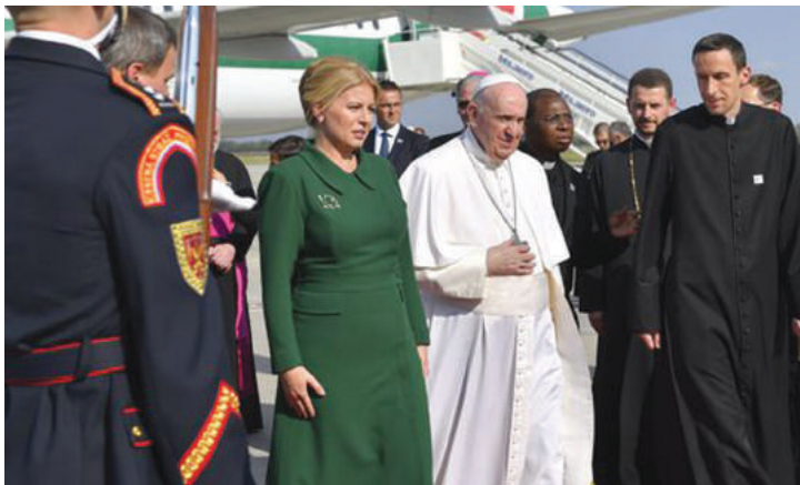
Pope Francis with president Zuzana Caputova at Bratislava Airport on September 12, 2021

Pope Francis has arrived on Sunday, September 12 afternoon to visit the Slovak Republic. He was welcomed at M.R. Stefanik Airport in Bratislava by the most supreme constitutional officials with a delegation and the Slovak bishops.