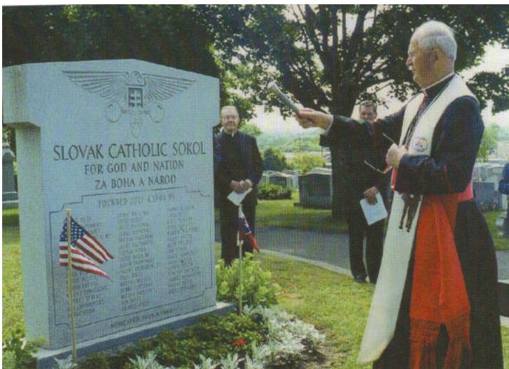
Cardinal Jozef Tomko is shown blessing the monument to the founders of the Slovak Catholic Sokol at St. Mary's Cemetery in Saddle Brook, NJ during the centennial celebration on July 9, 2005.