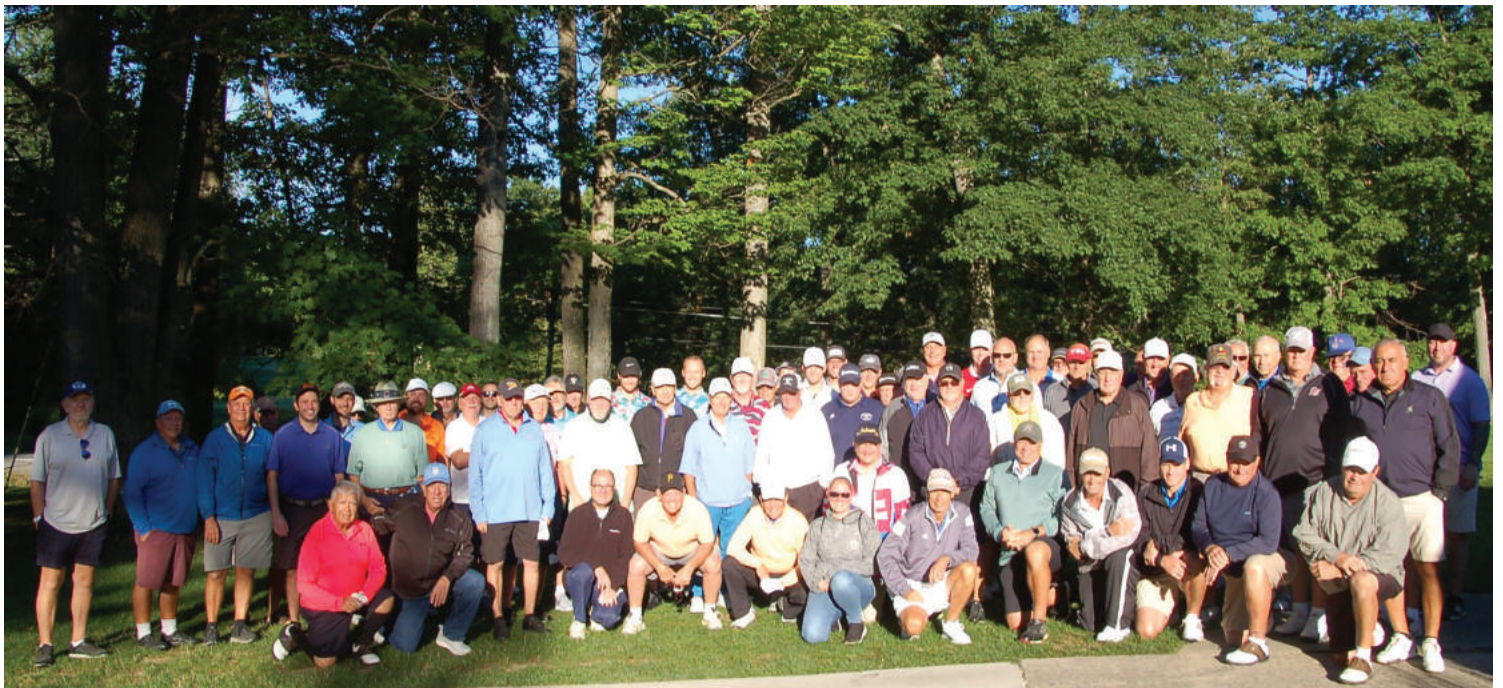
Group photo at Treasure Lake Gold Course.