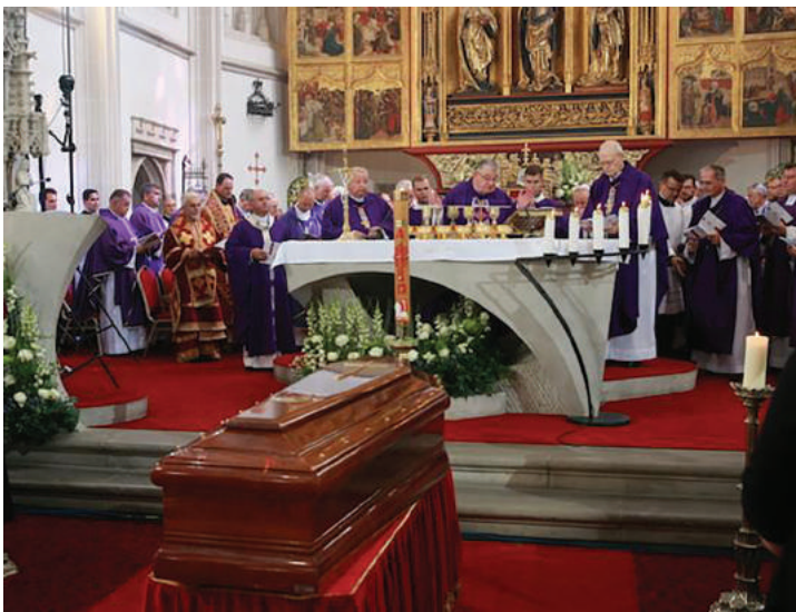
The funeral Mass in St. Elizabeth's Cathedral in Kosice.

Cardinal Tomko was the oldest member of the College of Cardinals. According to his wishes, he was buried in the Košice Cathedral, the body will be placed in the hitherto empty underground crypt in front of the main altar.