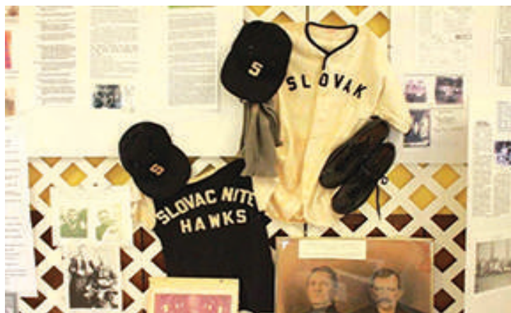
Documents related to the history of the Slovak community in Arkansas