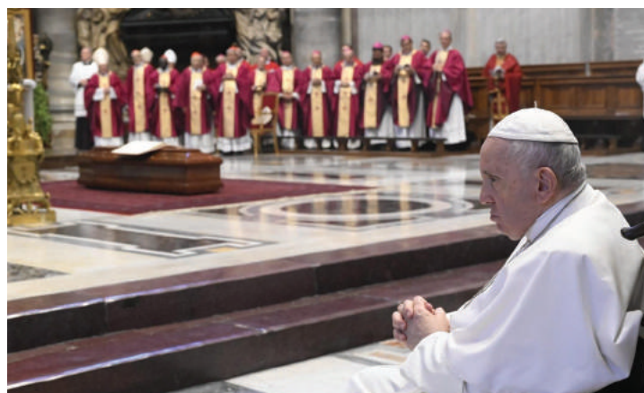
Pope Francis at the funeral Mass for the late Cardinal Jozef Tomko.

The last farewell to the cardinal was attended by thousands of people, among them the highest constitutional offi-