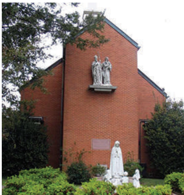
SS. Cyril and Methodius Church