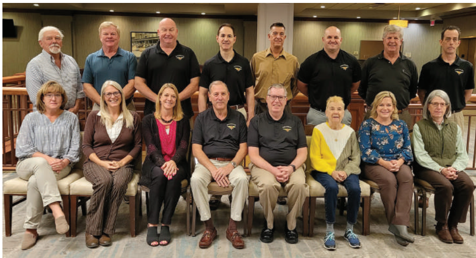
GROUP PRESIDENTS MEETING was held on October 1 st at Hilton Scranton & Conference Center in Scranton, PA.