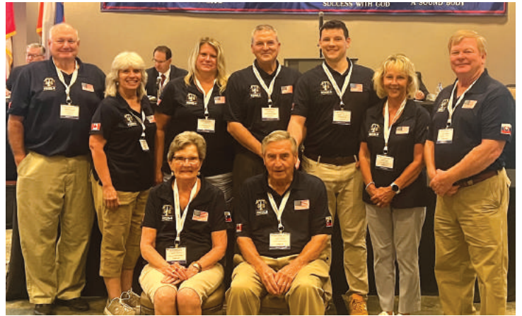
Group 3 Douglas, MA