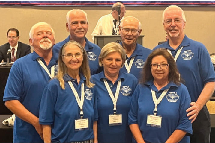
Group 2 Bridgeport, CT