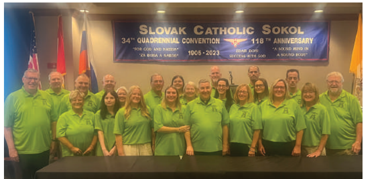
Group 7 Wilkes-Barre, PA