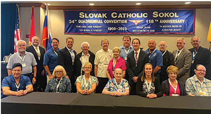
Group 1 Passaic, NJ