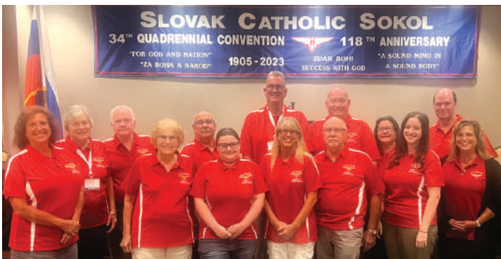
Group 17 Youngstown, OH