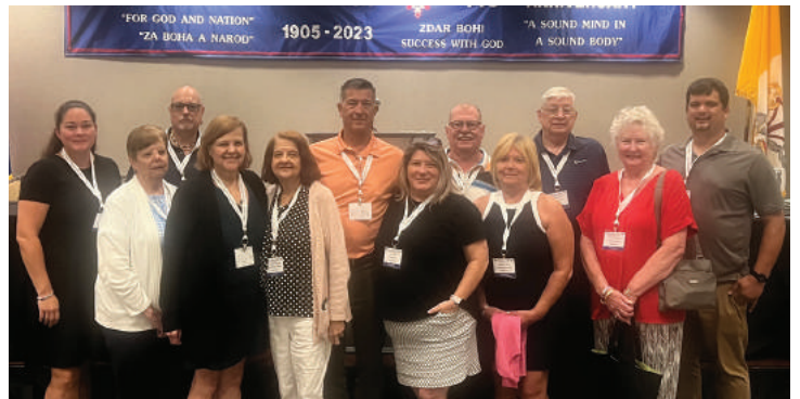
Group 12 Reading, PA