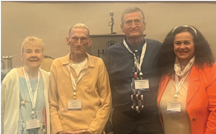
Group 16 Detroit, MI