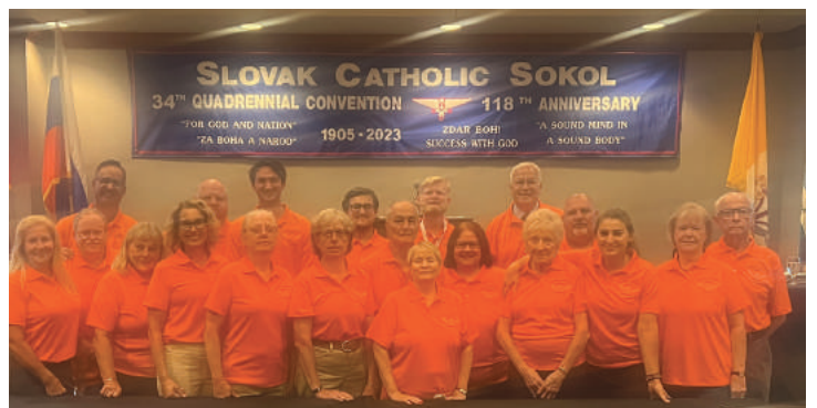
Group 5 Cleveland, OH