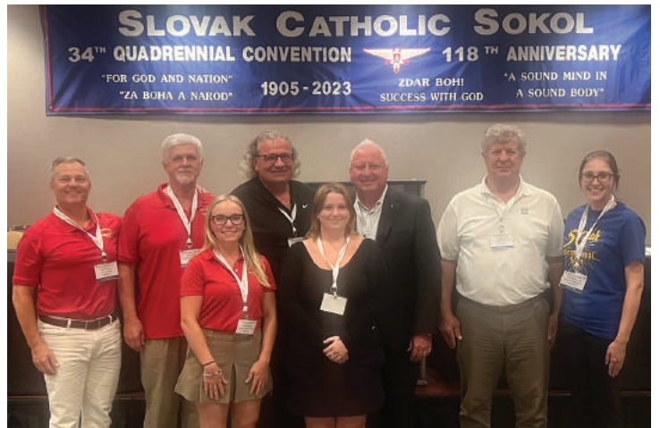
Group 19, Toronto, ON