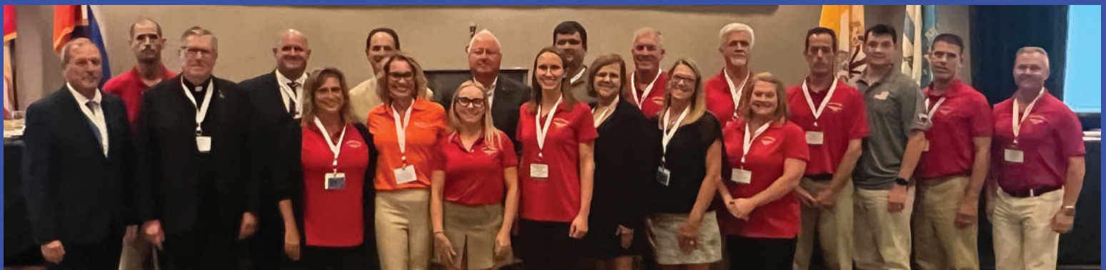
Members of the Supreme Assembly for 2020-2023 and 2024-2027.