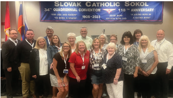
Group 14 Pittsburgh, PA