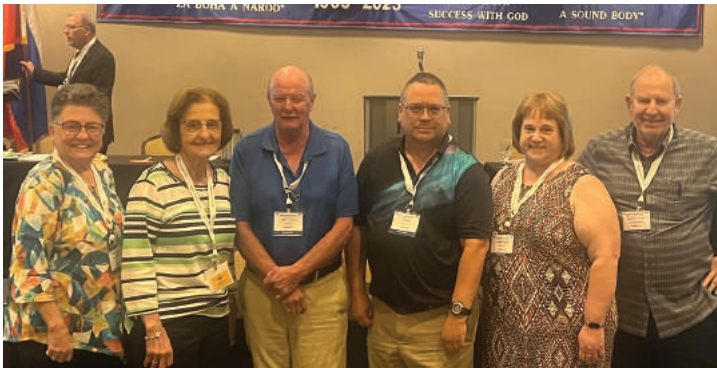
Group 9 Johnstown, PA