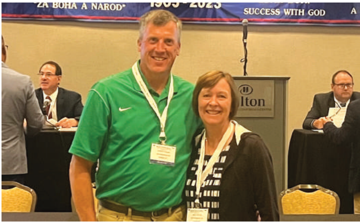
Group 11 Minneapolis, MN