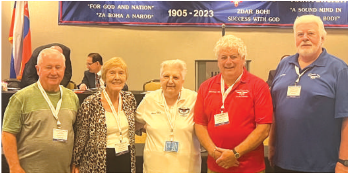
Group 6 Charleroi, PA