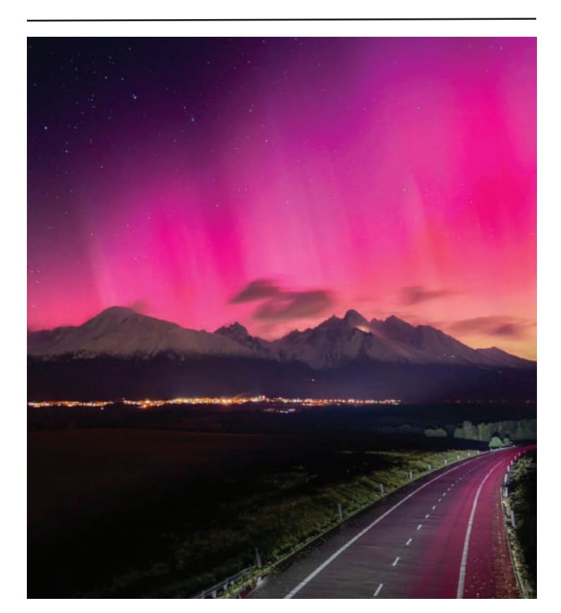
Breathtaking photo of the Northern Lights above the High Tatras in Slovakia on November 6, 2023.

"The government of the Slovak Republic will continue to support solutions to the conflict in Ukraine that are based on the principles of international law, including Ukraine's independence, sovereignty and territorial integrity within its internationally recognised borders and its inherent right to self-defence," reads the manifesto.