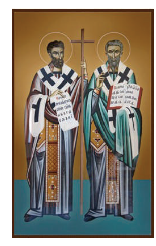
Learn more about SS. Cyril and Methodius at <a href="https://www.catholic.org/sa">https://www.catholic.org/sa</a> ints/saint.php?saint id=85

Because of their love for God and teaching the Gospel to the Slavic people, the brothers are considered the "Apostles of the Slavs." Their feast day is February 14<sup>th</sup>.