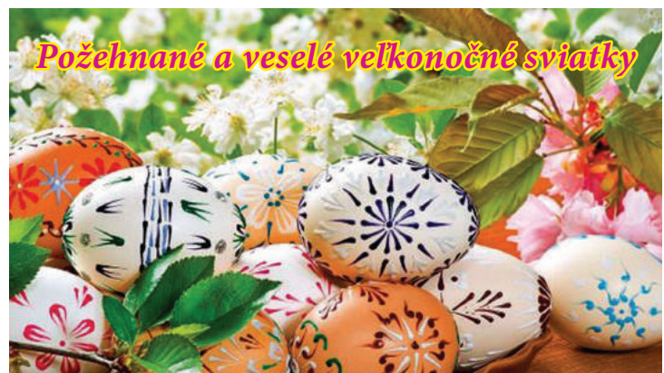
Požehnané a veselé veľkonočné sviatky

V slovenských domácnostiach sa zvykli konzumovať mäsové polievky, klobásky, slanina či koláč pečený z trojakej múky. Piekla sa aj vianočka, buchty, kapustníky, tvarožníky i lekvárniky. Ako nápoje pre sviatočné chvíle slúžili pre dospelých víno alebo pálenka.