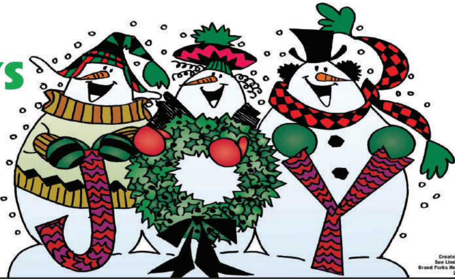
Created by Sue Lindlauf Grand Forks Herald 2011