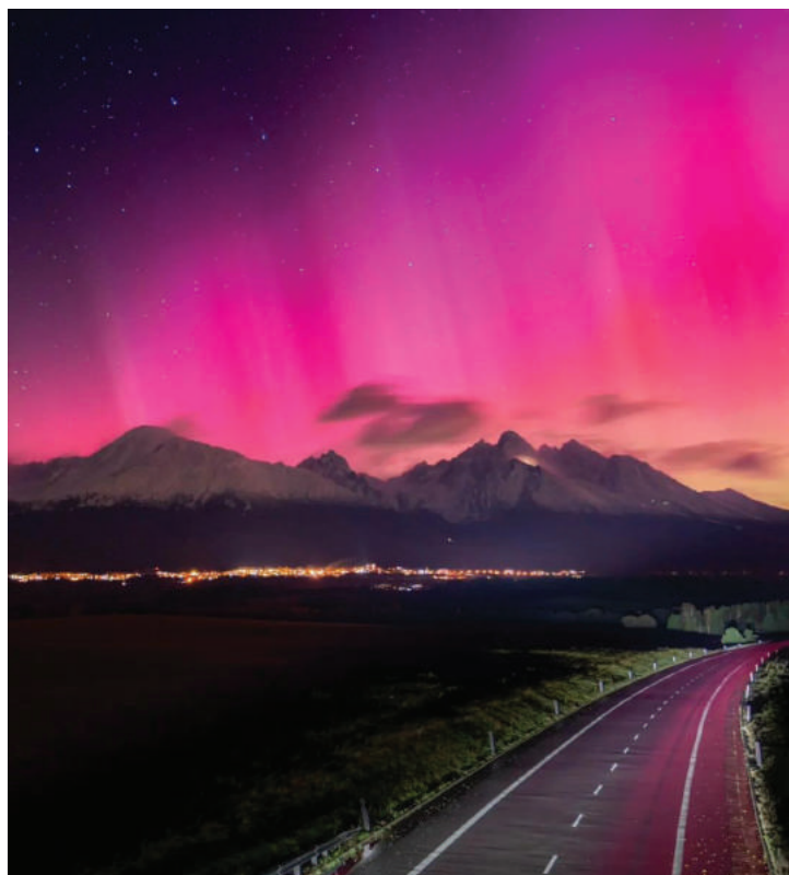
Breathtaking photo of the Northern Lights above the High Tatras in Slovakia on November 6, 2023.

"The government of the Slovak Republic will continue to support solutions to the conflict in Ukraine that are based on the principles of international law, including Ukraine's independence, sovereignty and territorial integrity within its internationally recognised borders and its inherent right to self-defence," reads the manifesto.