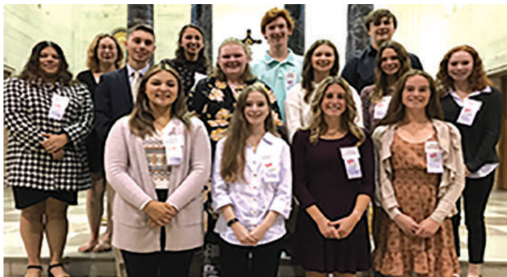
Juniors and Seniors who received Student Leadership Awards in person.