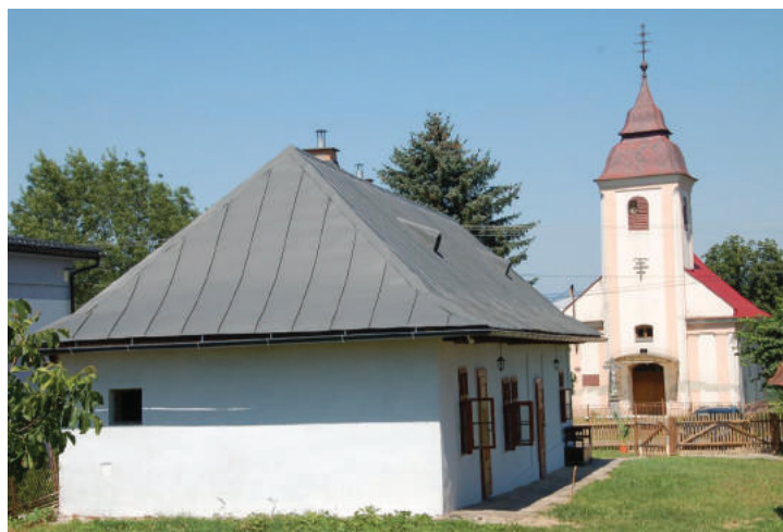
Ťahyňa, home of Kasigarda, the Museum of Slovak Emigration to N. America.